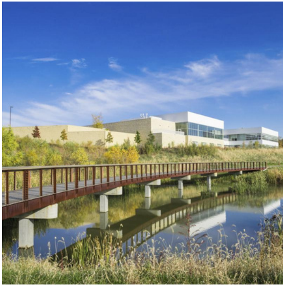
Congregation of Temple Israel

Tour Temple Israel, American Muslim Institute, and the Tri-Faith Center