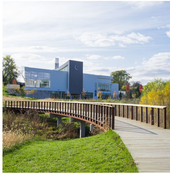
American Muslim Institute